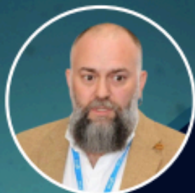
Introduced by THOM JONES